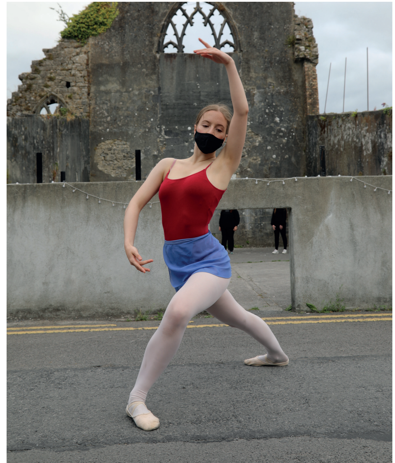
Bouncing Off the Walls.