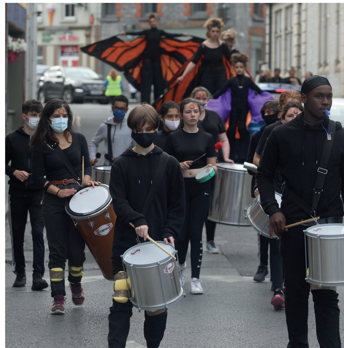
Bouncing Off the Walls.

The opportunity embraced within the Galway County Culture and Creativity Strategy 2023–2027 is to support people’s participation, inclusion and expression within communities, and further strengthen local creative economies.