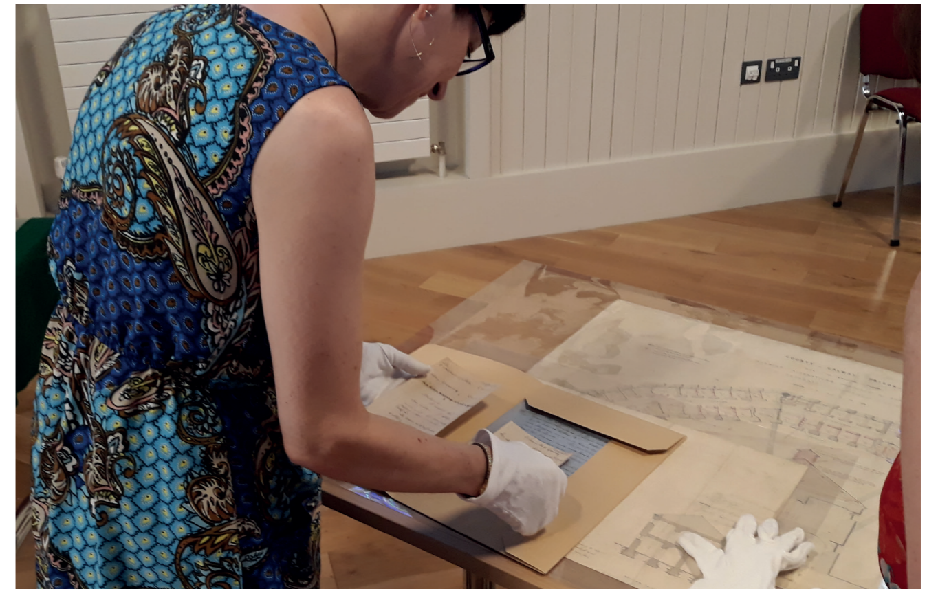
Sewing a Seed: Archives to Art.

with nursing homes to keep residents engaged through stories and song, culminating in a participatory event for their families and communities, and a DVD to support the process of transmission of folklore from older people to children in the community.